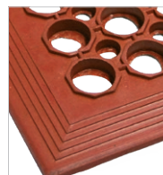
Terracotta - Grease Proof (GP)