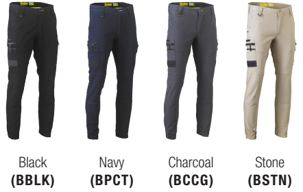
Black (BBLK) Navy (BPCT) Charcoal (BCCG) Stone (BSTN)