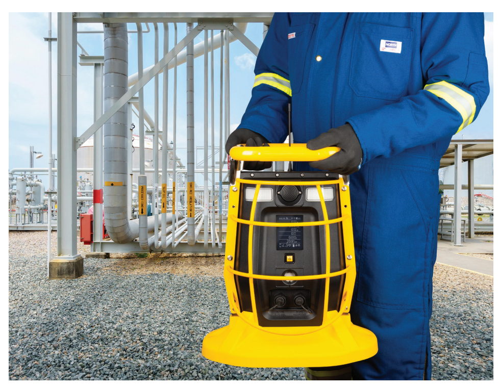
Grab and go. Like other Honeywell BW products, Honeywell BW ^{\text{TM}} RigRat is engineered for ease, with one-button operation. Simply turn it on and it's ready to deploy — no expertise required. Convenient handles and a carrying strap make it easy to take with you.