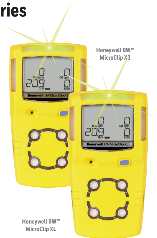
Honeywell BW™ MicroClip XL

For a complete list of kits and accessories, please contact Honeywell Analytics.