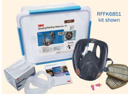
RFFK6851 kit shown