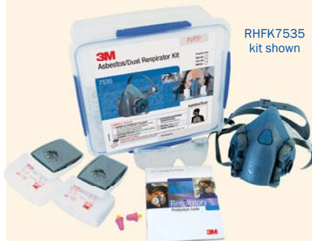
RHFK7535 kit shown