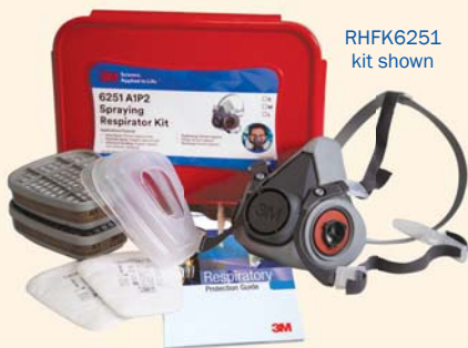
RHFK6251 kit shown