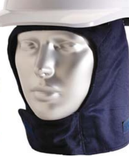
Wear with hard hat or as a balaclava