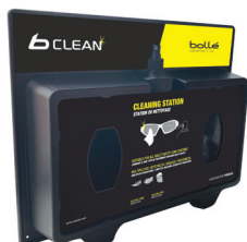
Reusable Cleaning Station