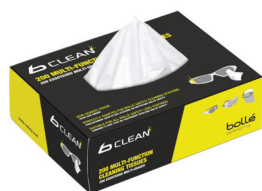
Dry Cleaning Tissues Pack