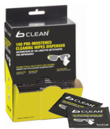
Pre-moistened Cleaning Wipes