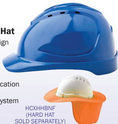
HCXHBNF (HARD HAT SOLD SEPARATELY)