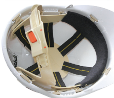
HGX060 (HARD HAT SOLD SEPARATELY)