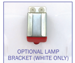
OPTIONAL LAMP BRACKET (WHITE ONLY)