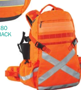
MBP6476 MINERAL KING