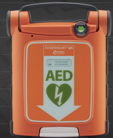
CARDIAC SCIENCE POWERHEART AEDS

Tested every day. Rescue Ready® every day.