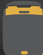
PHYSIO-CONTROL CR® PLUS 3