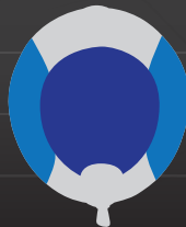
HEARTSINE® SAMARITAN® 450P 2