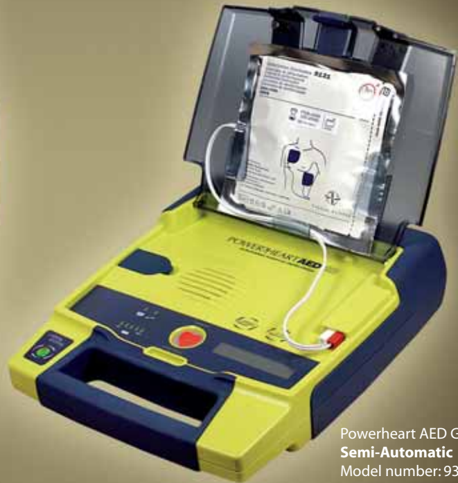
Powerheart AED G3 Plus Semi-Automatic Model number: 9390E