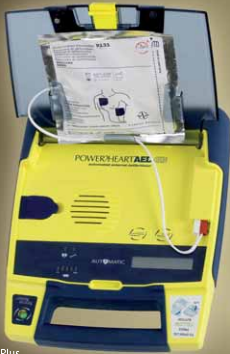
Powerheart AED G3 Plus Automatic Model number: 9390A