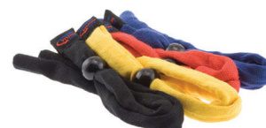
VSXC550 Cloth Tube Spectacle Strap