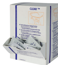
VSXW1011332 Alcohol-free Lens Wipes