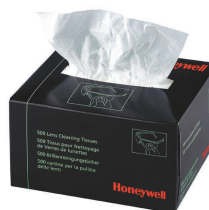
VSXT1011379 Cleaning Tissues Dry Pack