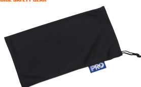
VSXPSP Spectacle Pouch