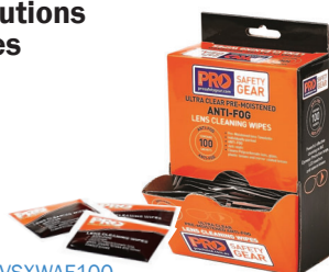
VSXWAF100 Cleaning Wipes Anti-fog