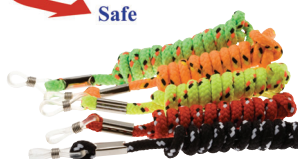
VSXC500 Knitted Spectacle Cord