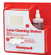
VSXS1011377 Reusable Cleaning Station