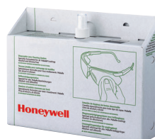
VSXS1011380 Disposable Cleaning Station