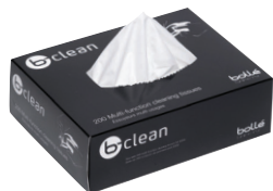
VSXTB401 Cleaning Tissues Dry Pack