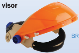
VB900 BROWGUARD ONLY