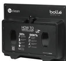
VSXSB600 Reusable Cleaning Station