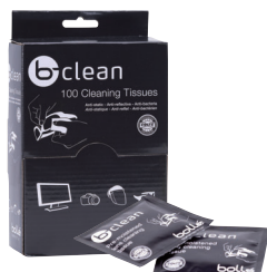
VSXWB100 Alcohol-free Lens Wipes